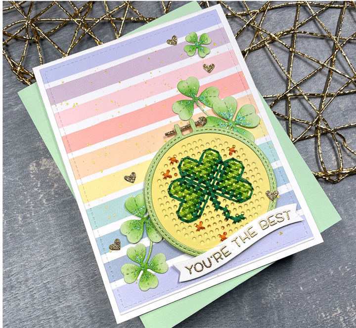
created for lawn fawn by chari moss

Pattern for Embroidery Hoop Lawn Cuts by Chari Moss