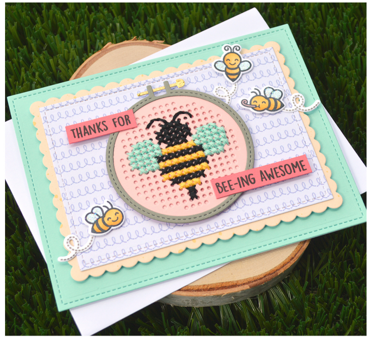
created for lawn fawn by chari moss

Pattern for Embroidery Hoop Lawn Cuts by Chari Moss