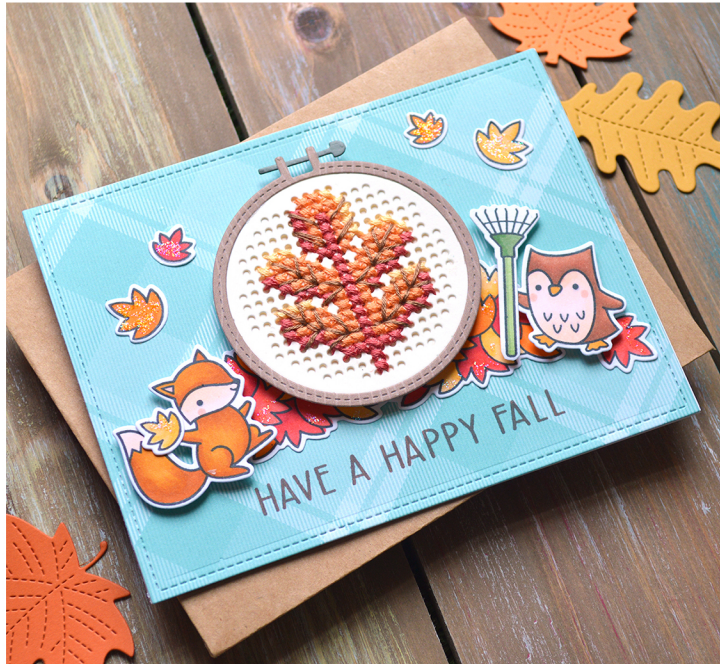
created for lawn fawn by chari moss

Pattern for Embroidery Hoop Lawn Cuts by Chari Moss