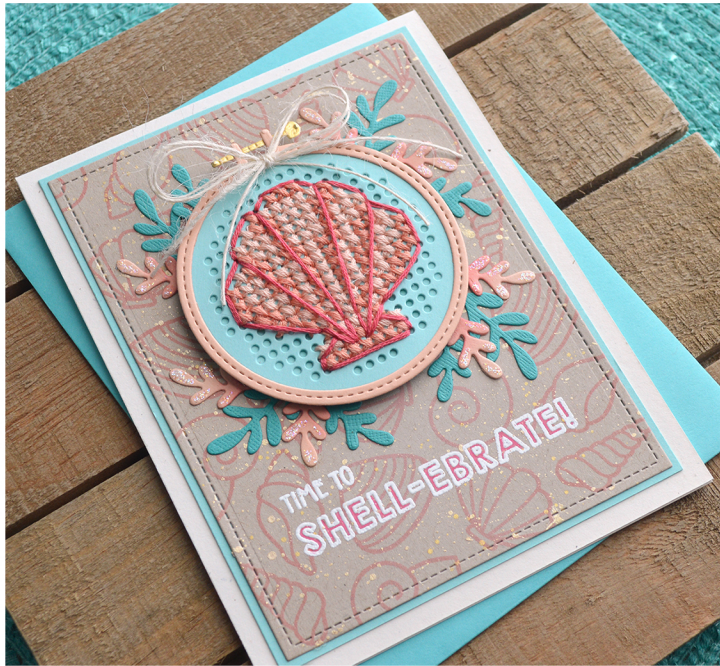
created for lawn fawn by chari moss

Pattern for Embroidery Hoop Lawn Cuts by Chari Moss